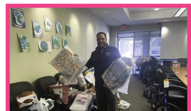
Flint Hills National