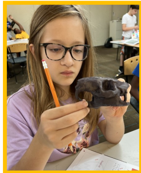
Our youth enjoyed workshops from Exploration place as they examined and discovered fossils from around the world.