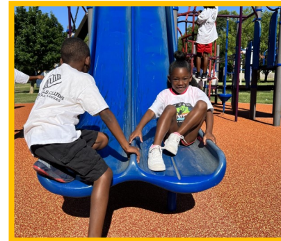
Members spent time outdoors at the various parks around Wichita in order to truly maintain a well-rounded healthy lifestyle!