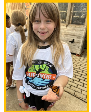
After learning about the importance of helping the environment, members were able to release butterflies in the Botanica Butterfly House!