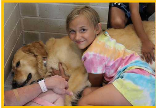
Members were able to pet and cuddle with our furry friends at Love on a Leash of South Central Kansas!